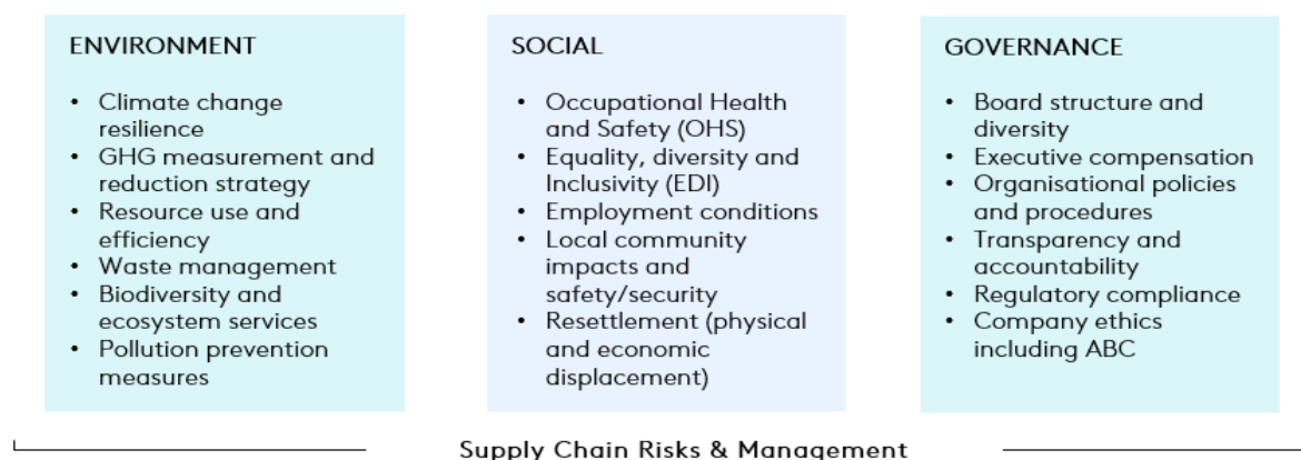
Figure 2: Typical ESG issues considered in the investment process.

This section outlines CAM's commitments on key ESGI issues across its strategies, with the aim to provide the baseline ESGI framework for all investments whilst individual strategies may build on this to support their individual investment thesis.